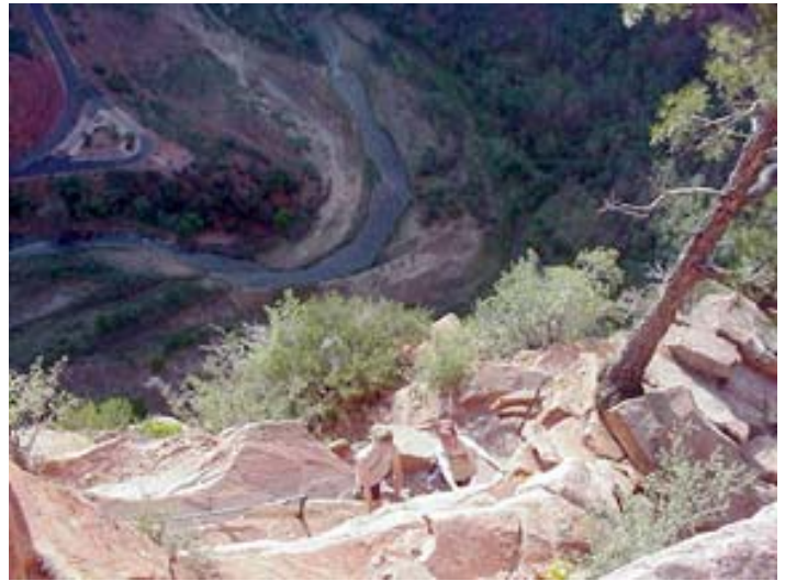
Students climb cliffs high above the Colorado River.