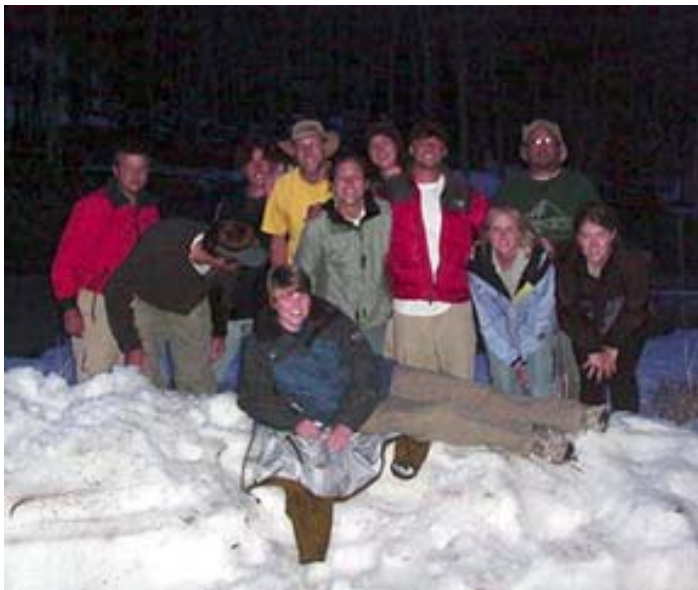
Hours away from desert conditions, the group enjoyed a snowball battle in the Rocky Mountains.